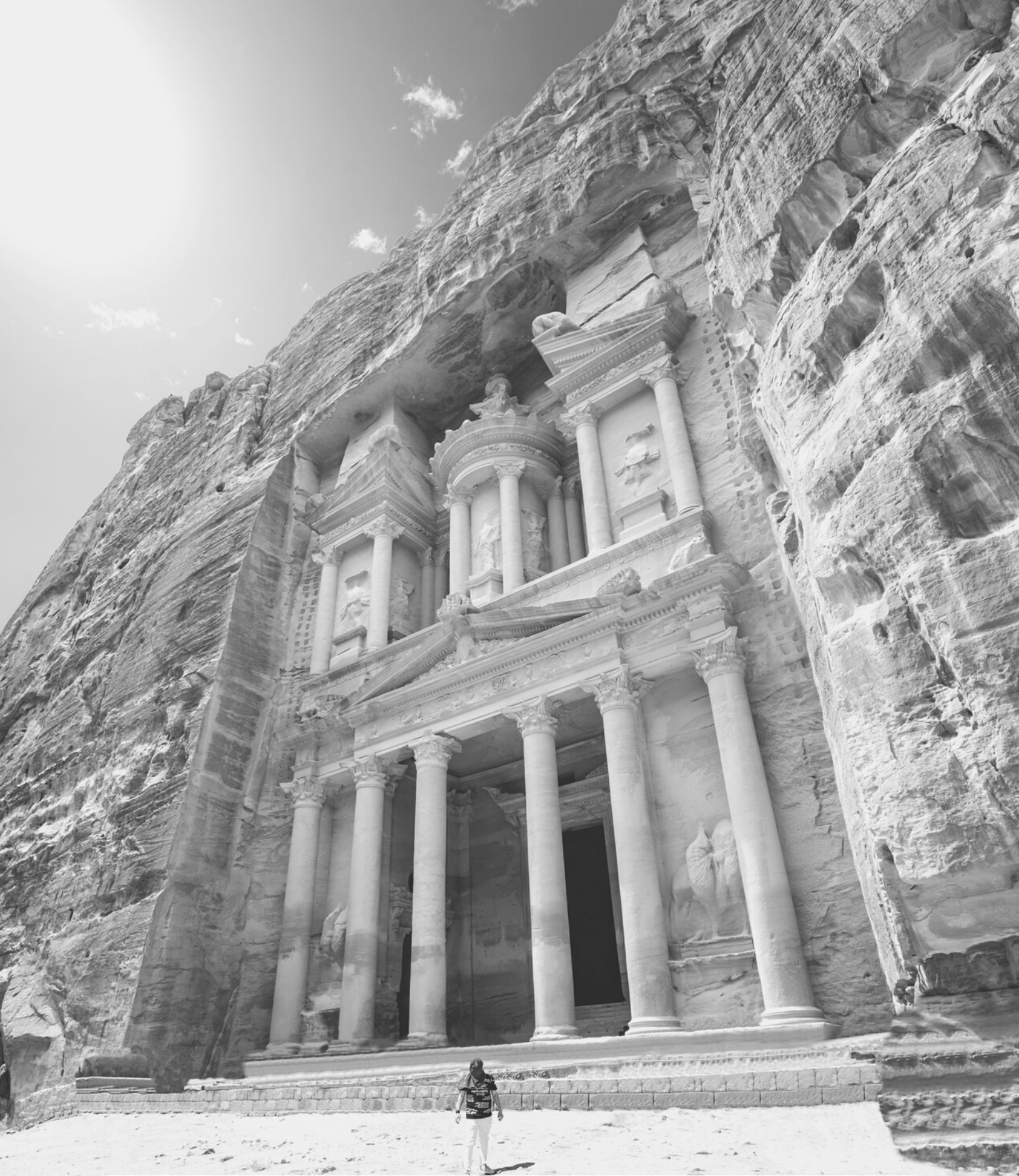
Caption: A tourist stands at Petra, Jordan