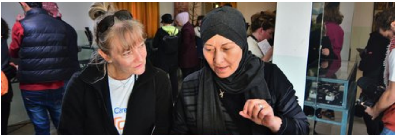
Image: A woman explains the jewelry making process to an event attendee.

Tourism Cares with Jordan created connections between stakeholders that had not previously worked together in a collaborative way. By establishing a new partnership with the Jordan Inbound Tour Operators Association (JITOA) and the Jordan Tourism Board, the foundation was set to build a working relationship on future initiatives benefiting communities through responsible tourism development.