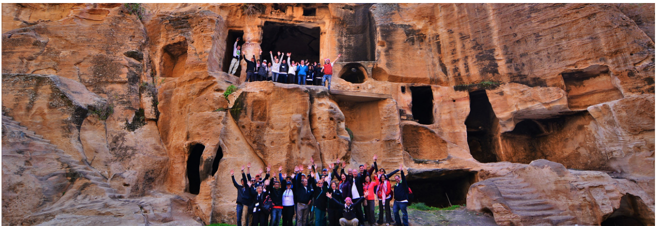
Image: A group celebrates in Jordan at Little Petra

By doing what's right for travel, we create opportunities, empower communities, amplify culture and protect the environment while fostering diverse perspectives and building inclusivity and understanding. www.tourismcares.org