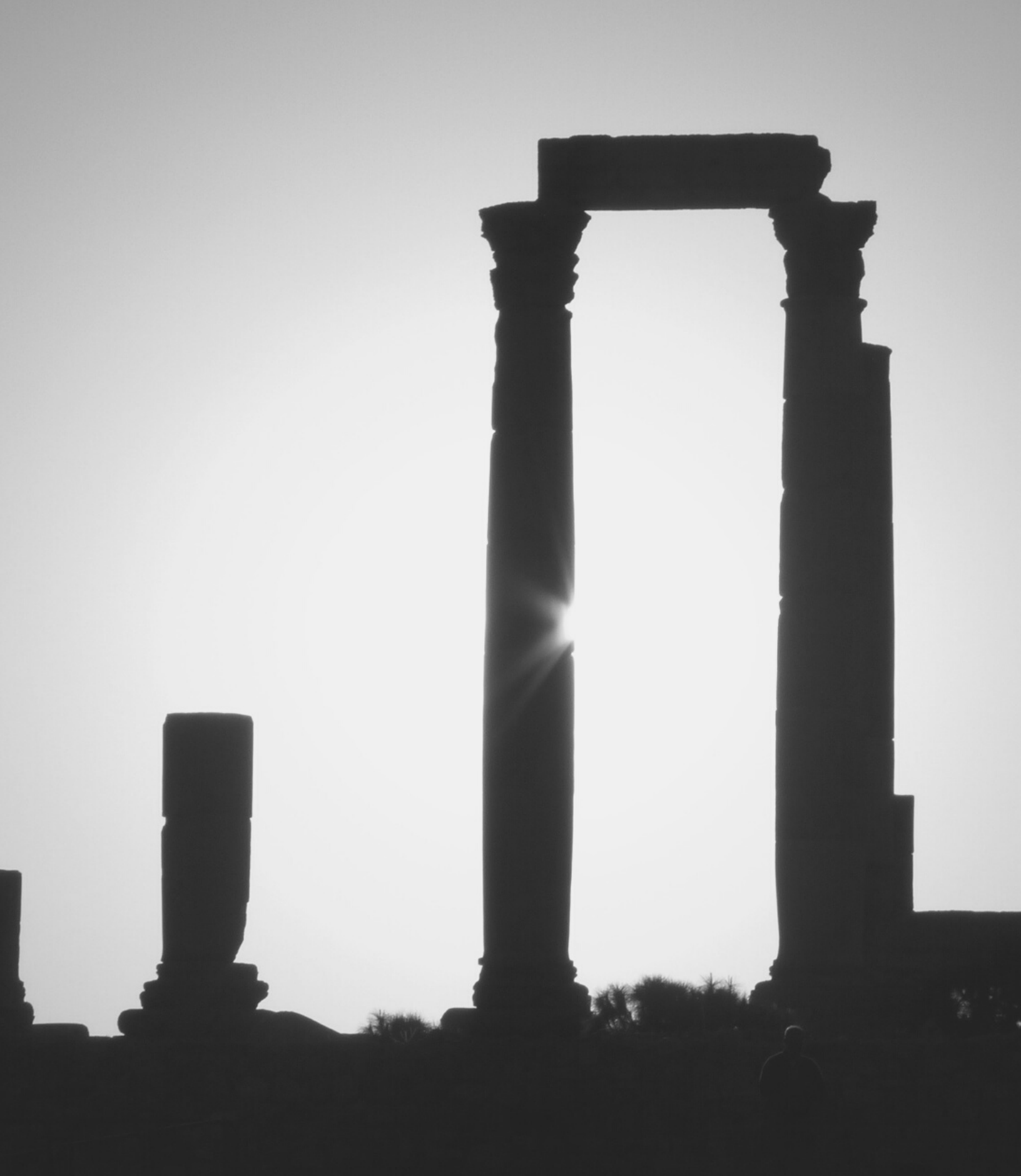
Caption: Sunset in Jordan