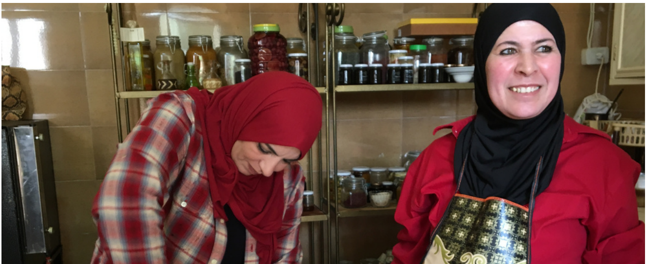
Caption: The women of Iraq Al Amir prepare a meal in their kitchen for guests.

The Iraq Al Amir Women's Cooperative Association was founded by the Noor Al-Hussein Foundation over two decades ago. It aimed to make the women financially independent and to raise their standard of living by increasing their income and preserving local heritage. The cooperation exists to keep their culture alive, protect the environment, and to provide meaningful employment for local women in the village.