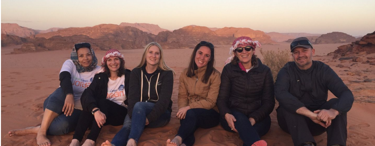
Caption: A group of Summit attendees smile for the camera at Wadi Rum.

move with a portfolio of transferable skills. Distribution of the wealth of tourism creates more dignified livelihoods, happier communities, authentic demonstrations of cultural capital, and overall provides a better place to live. And the best places to live are also the best places to travel.