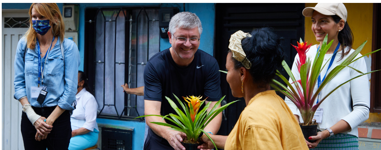
Caption: Summit attendees interact with the community in Colombia.

If you are interested in hosting a Meaningful Travel Summit in your destination contact community@tourismcares.org