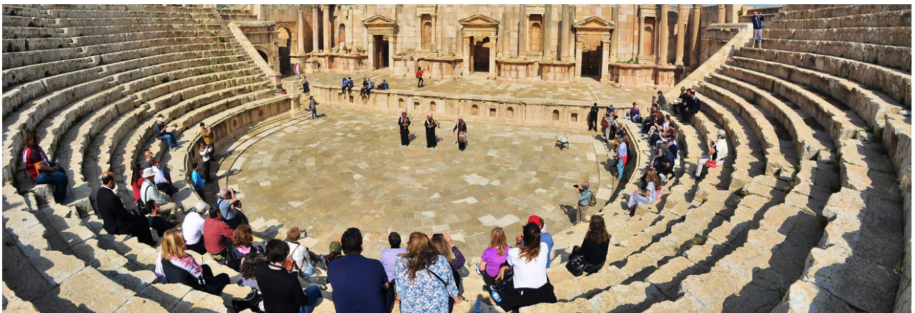
Image: A group of tourists watch traditional music and dance performance.